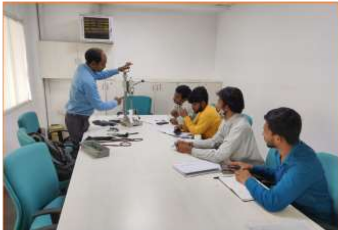
Amith Garment Services Staff Training The Staff of Customer organization