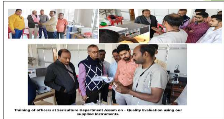
Training of officers at Sericulture Department Assam on - Quality Evaluation using our supplied Instruments.